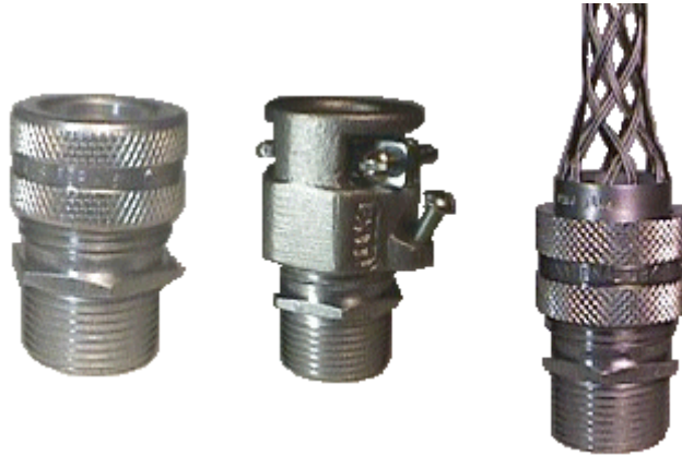
COMPRESSION MECHANICAL WOVEN GRIP